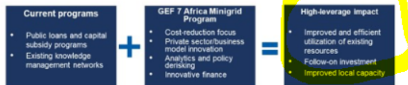
Figure 2. Additionality of the GEF 7 African Minigrid Program