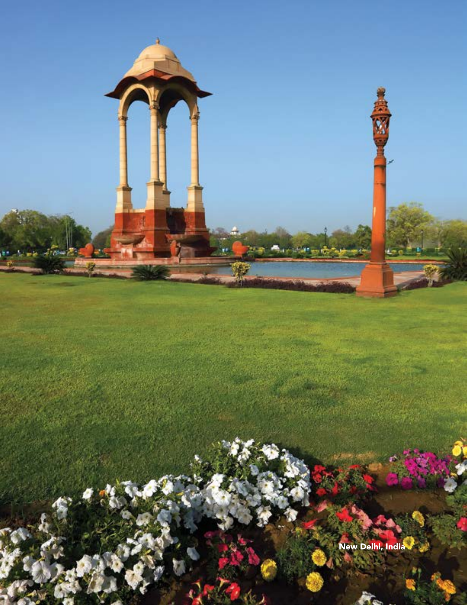
New Delhi, India