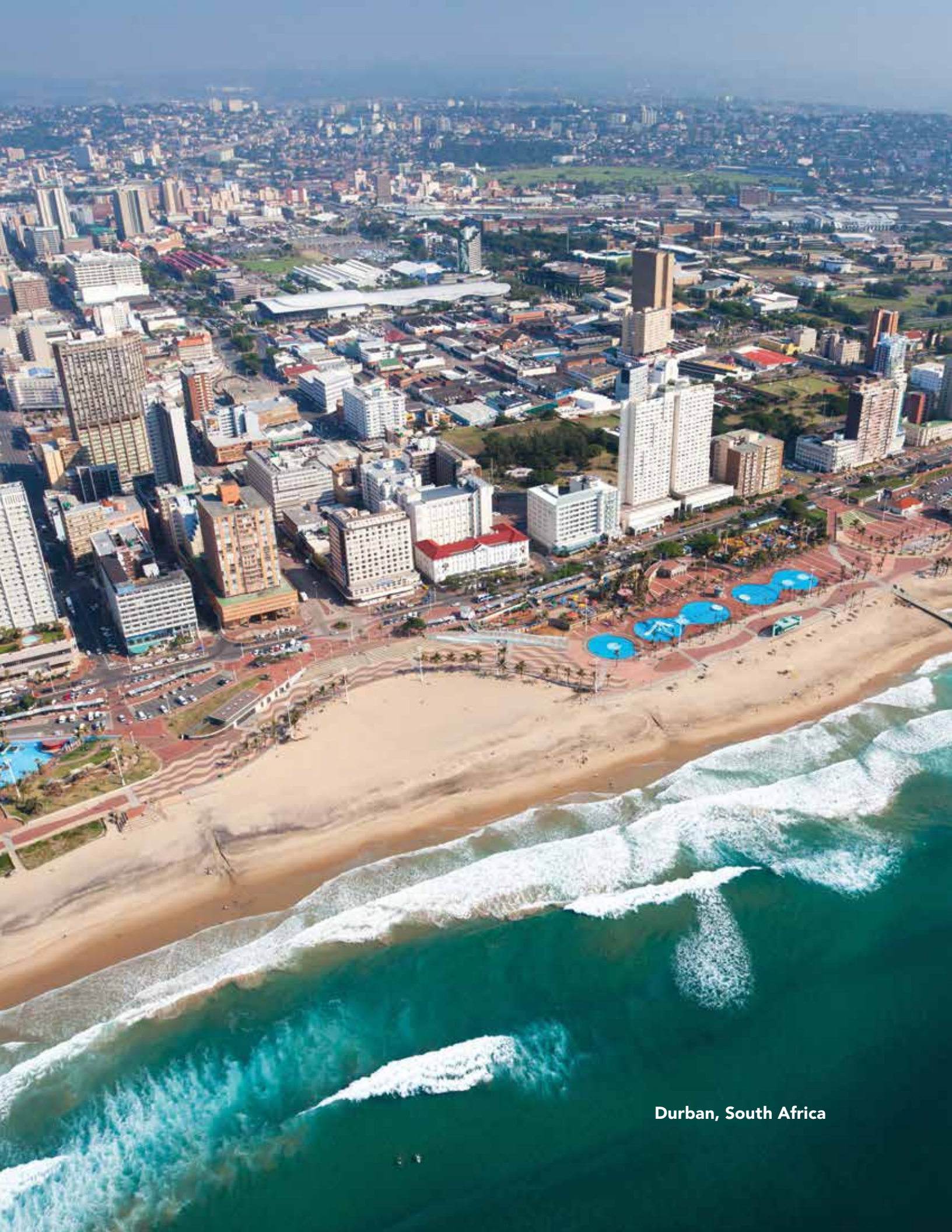
Durban, South Africa