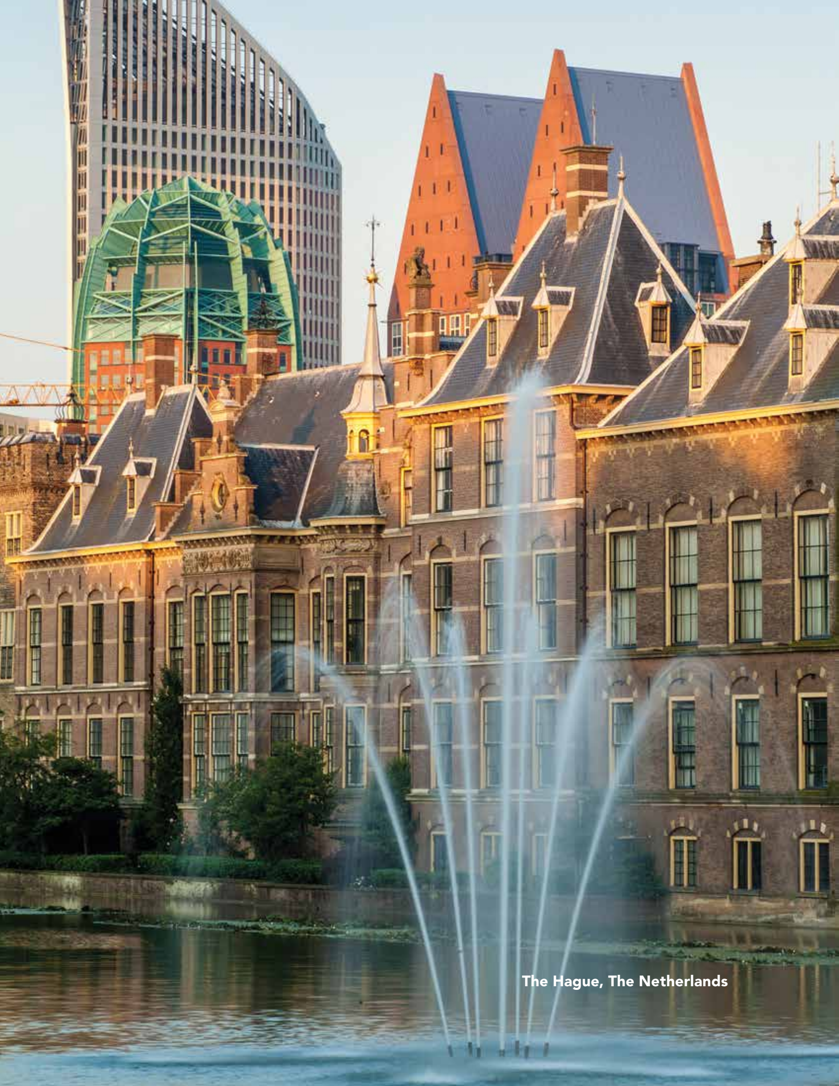
The Hague, The Netherlands