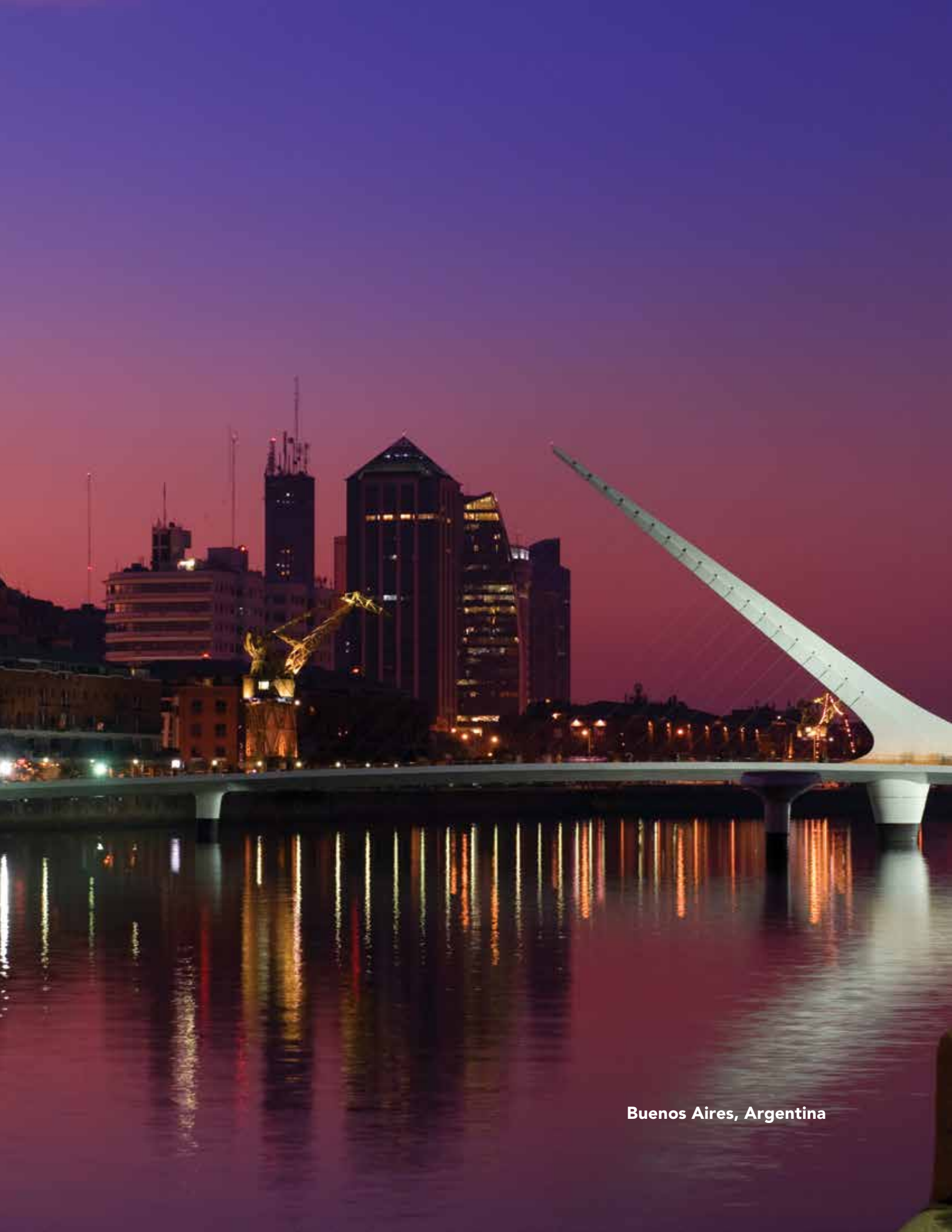
Buenos Aires, Argentina