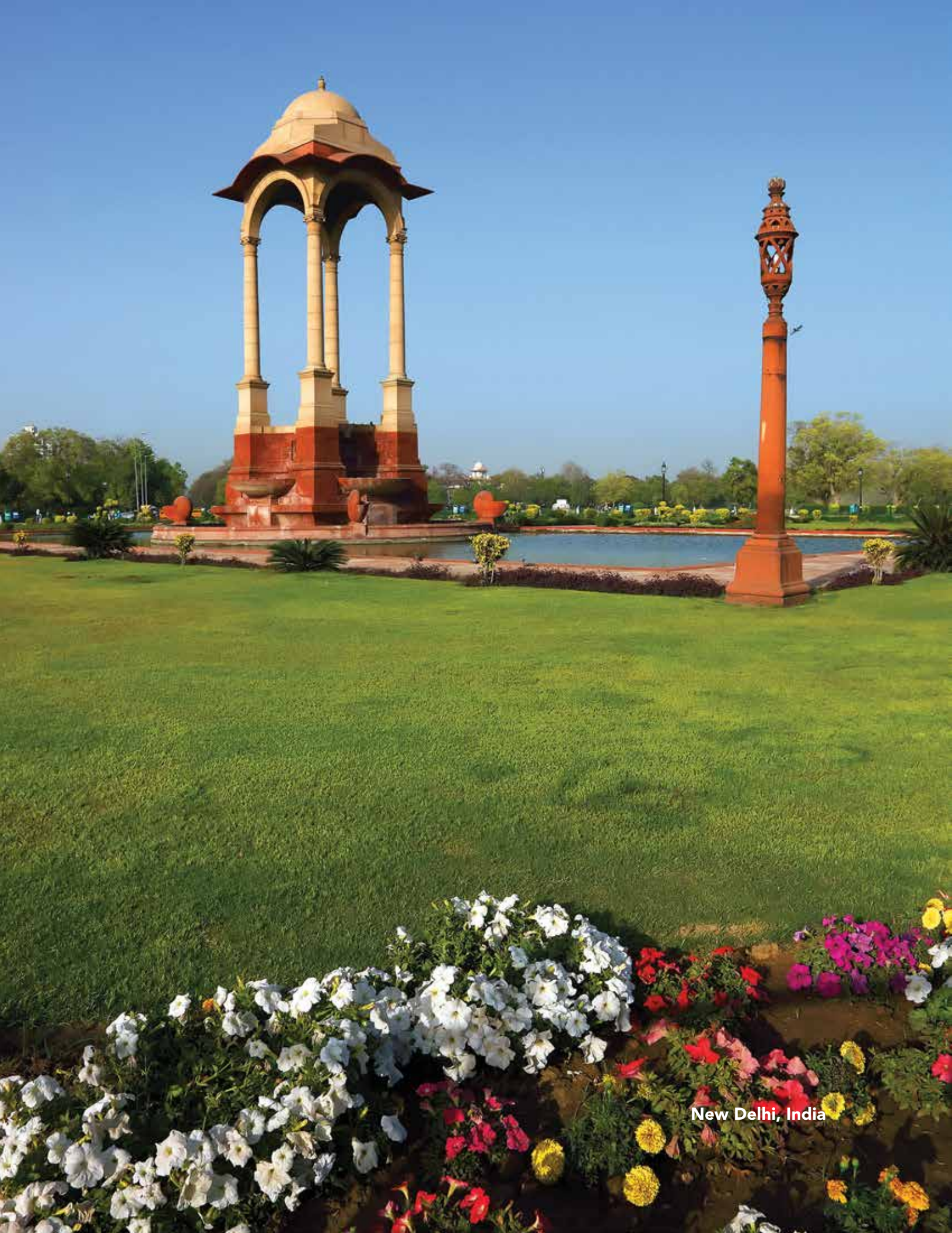
New Delhi, India