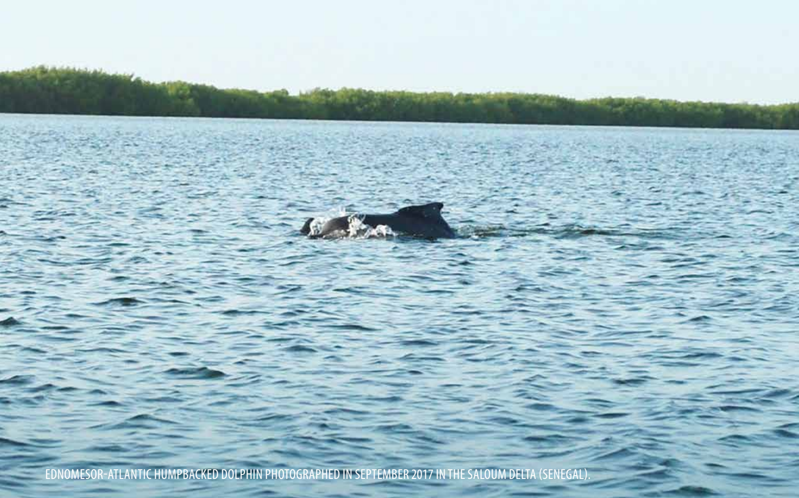
EDNOMESOR-ATLANTIC HUMPBACED DOLPHIN PHOTOGRAPHED IN SEPTEMBER 2017 IN THE SALOUM DELTA (SENEGAL).

In Cameroon, the southern coastline extending from the town of Kribi to the border with Equatorial Guinea is home to the rare Atlantic humpback dolphin, as well as to many other species of dolphins, humpback and sperm whales, and African manatees. After being seen in 1892, the next sighting of this dolphin in the area was only recorded 119 years later, when a group of 12 animals was observed in 2011.