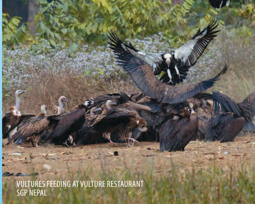
VULTURES FEEDING AT VULTURE RESTAURANT SGP NEPAL