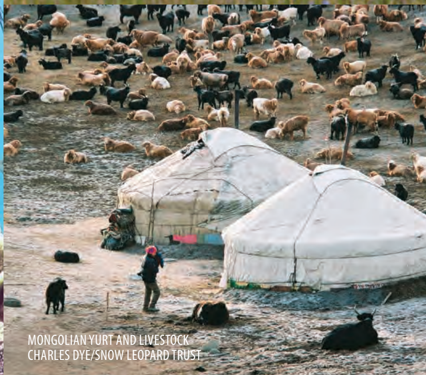
MONGOLIAN YURT AND LIVESTOCK