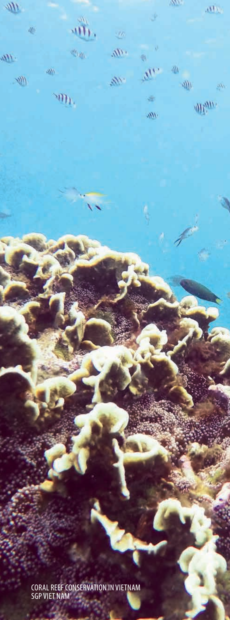
CORAL REEF CONSERVATION IN VIETNAM SGP VIET NAM