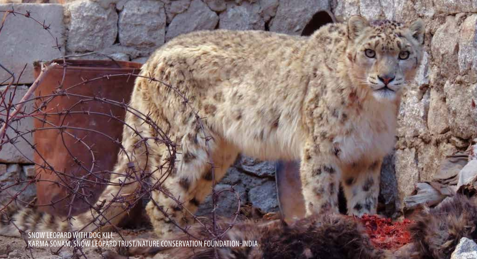
SNOW LEOPARD WITH DOG KILL

Under SGP's Innovation Programme on Big Cats, further consolidation activities are ongoing in Afghanistan, Bhutan, China and Tajikistan. SGP has also contributed to the creation of the Global Snow Leopard and Ecosystem Protection Program (GSLEP) and its Secretariat, a global partnership among the 12 home range countries, donors, and key partners to conserve the snow leopard and its habitat.