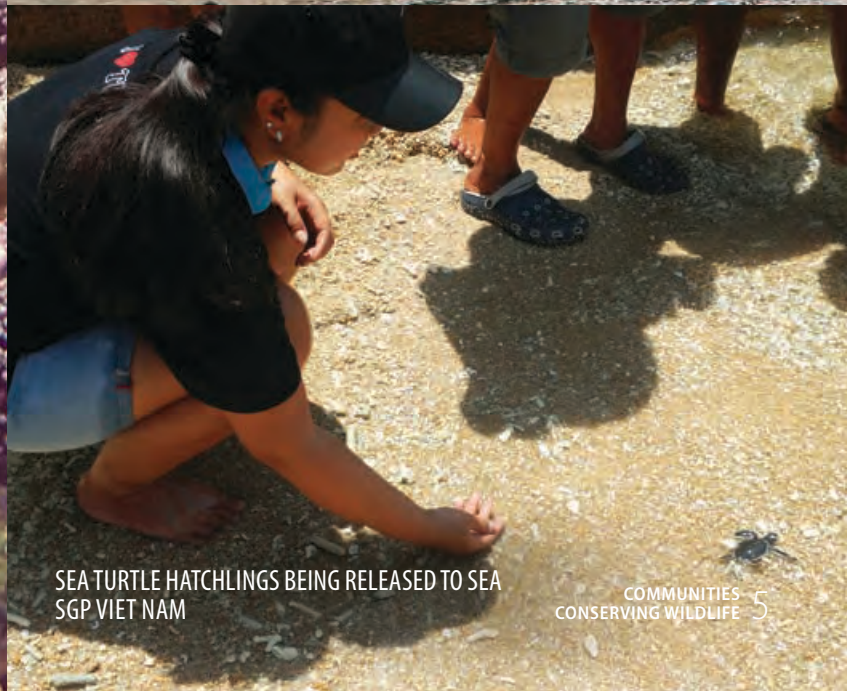
SEA TURTLE HATCHLINGS BEING RELEASED TO SEA SGP VIET NAM