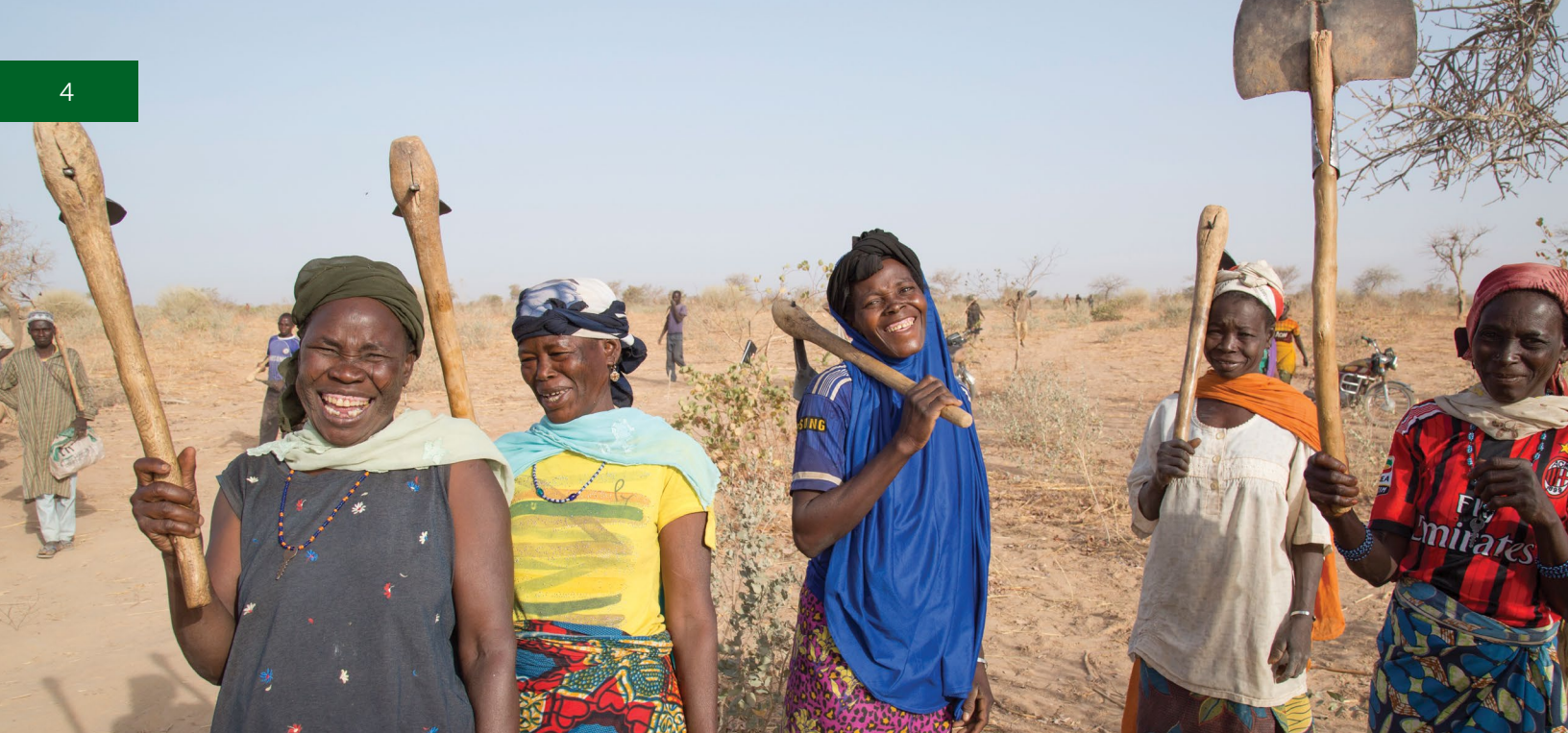
Women's contribution to land restoration activities

farming in Niger's the most affected regions by wind and water erosion. Knowledge sharing and exchanging platforms on sustainable land management practices and ascertaining land tenure among both family farmers and local governments was a key to scaling up the project in other regions. As a result of the project, the Platform for Dialogue on Sustainable Land Management was established both at the national and regional levels. Niger's successful practices are now shared beyond the country, as integrated approach to address land degradation, water, GHG emission and biodiversity loss (for instance, at the UNCCD COP14 in India, September 2019). In addition, strong partnership with local research institutions was useful to improve scientific monitoring and impact evaluation.