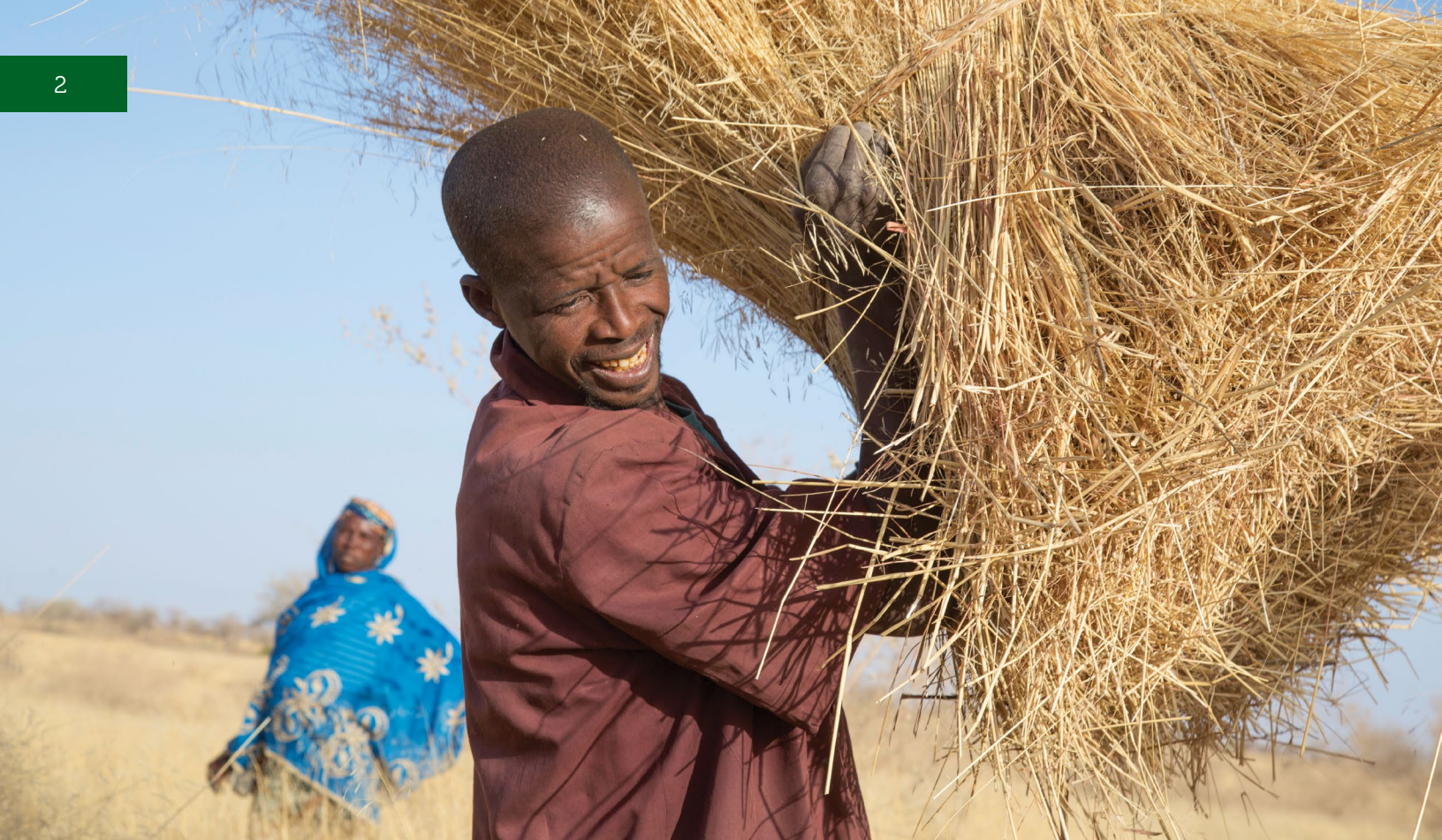
Harvesting forage for animals after regeneration of degraded lands @IFAD ProDAF Niger