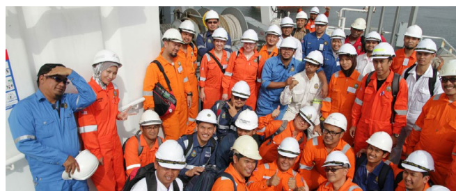
GloMEEP National workshop in Johor, Malaysia (February 2017)

For example, Jamaica, one of the LPCs, noted that the project had helped them significantly in overcoming limited resources and realigning or expanding their legislative framework to ensure compliance with treaties. The project had broken through the common 'silo' approach of government departments working in isolation, with overlapping and often