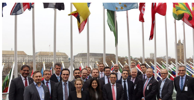
Global Industry Alliance to Support Low Carbon Shipping, Task Force Meeting in London, United Kingdom (December 2017)

The impact on climate change, ocean acidification, and port air quality from shipping energy use and fuel consumption necessarily spans the maritime transportation and environmental sectors. Thus, solutions require a coordinated effort between government, industry, and other stakeholders across these sectors. GloMEEP stakeholders included all relevant maritime sectors such as government agencies, international organizations, industry groups, training and R&D institutes, and environmental organizations. To facilitate this wider participation of stakeholders, the project management structure defined each party's role at national, regional, and global levels. Within this three-layer approach, LPCs were able to receive support through the project. For example, technical guidance and training was