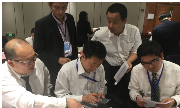
GloMEEP workshop on the IMO data collection system for fuel oil consumption (November 2018, Hangzhou, China)