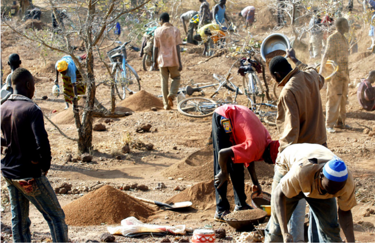
Gold mine in Africa.

Mediating factors related to rural incomes, land tenure, governance, strength and inclusiveness of resource management institutions, and gender equity 27 are often critical in influencing whether changes in the availability of resources foster adaptations – or spur conflict and exodus. While rarely the simple or sole cause of conflict and insecurity, environmental change (including climate change) is increasingly characterized as a “risk multiplier” 28 . For example, severe and prolonged drought in Syria and the Greater Fertile Crescent in 2006 spurred massive rural to urban migration and was a contributing factor to the ongoing conflict 29 . In most cases, while natural resources may be linked to the root cause, by the time the conflict has escalated to violence, the drivers are mixed with a range of factors. This means that efforts to remedy the natural resource drivers need to complement efforts to address the political context and associated stresses 30 .