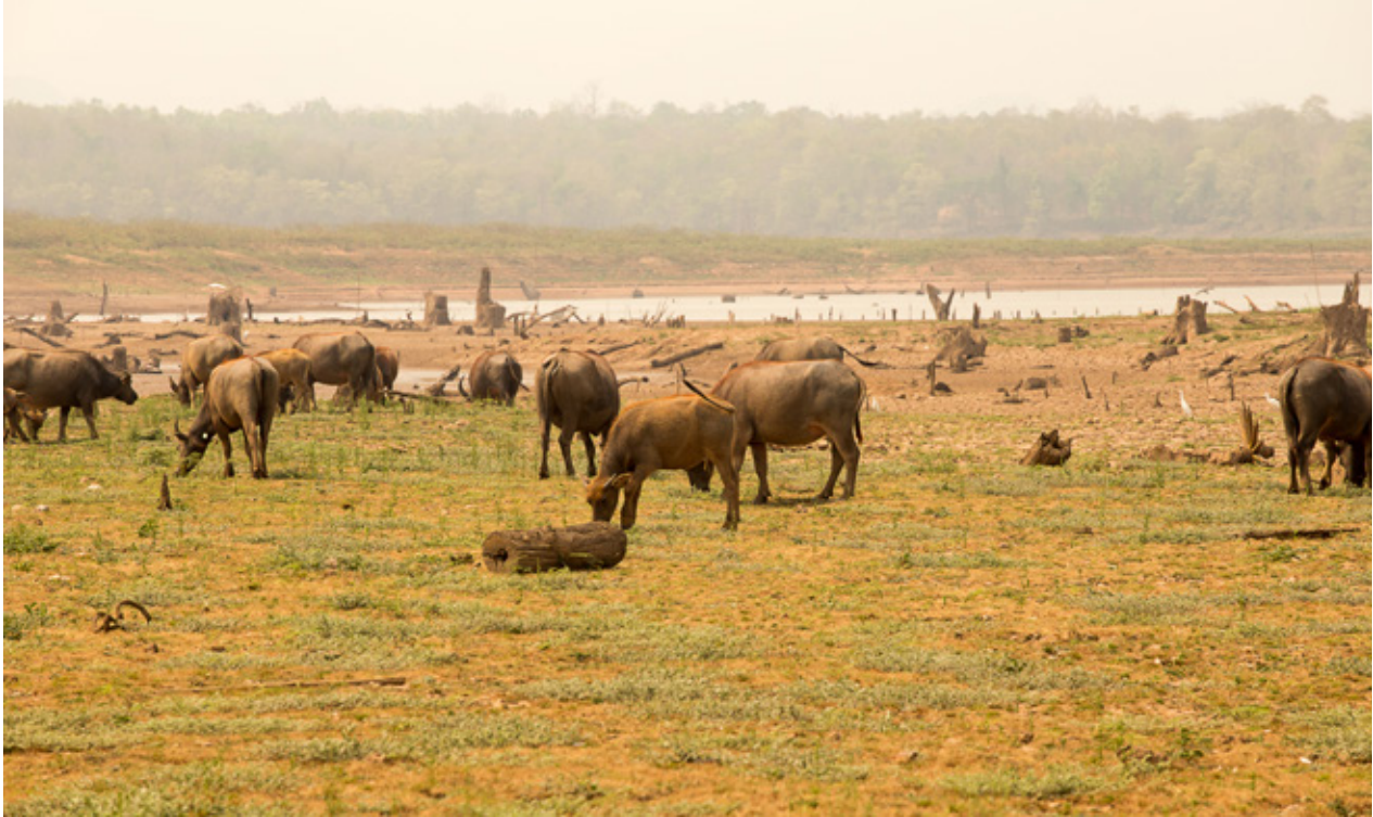
Herd of cows grazing in dried up river bed.

make a clearer link to the more immediate concerns of employment and livelihoods, equity, social stability and effective governance. In the near term, this could be done by incorporating conflict sensitivity, mitigation, and risk reduction into the project theory of change, in cases where interventions aim to reduce social and economic vulnerabilities linked to environmental change. This is additional to the consideration of generic conflict risk outside the scope of intervention. Doing so could potentially leverage greater support for the GEF mission as well, particularly when donor governments, development agencies, and foundations have sound evidence to link their environmental investments to human well-being outcomes. Substantial guidance, including from GEF agencies, provides tools for assessing and articulating these links 55 . In the longer term, the GEF might consider developing environmental security indicators to monitor progress.