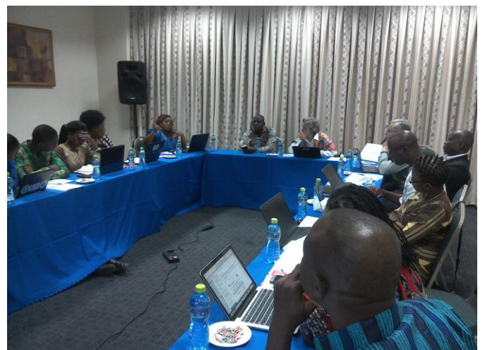
Cross Section of Participants at the Workshop.