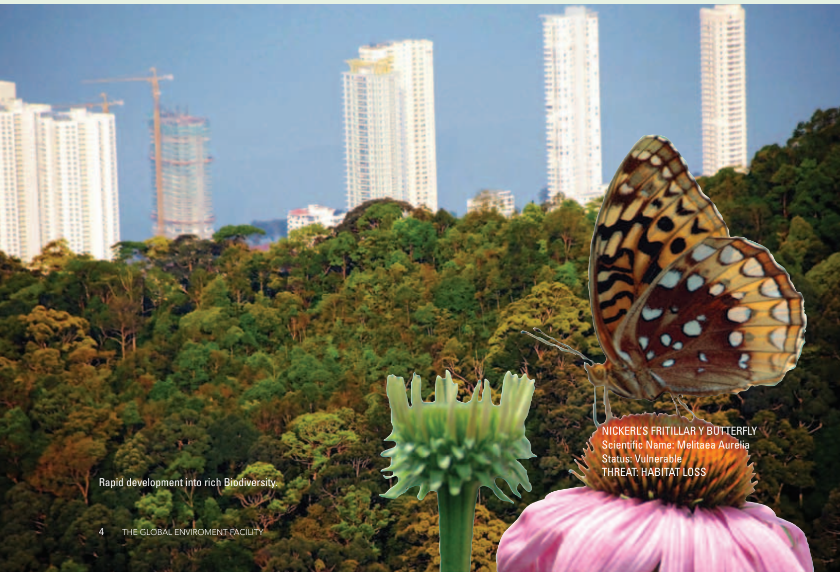
NICKERL'S FRITILLARY BUTTERFLY Scientific Name: Melitaea Aurelia Status: Vulnerable THREAT: HABITAT LOSS

Rapid development into rich Biodiversity.