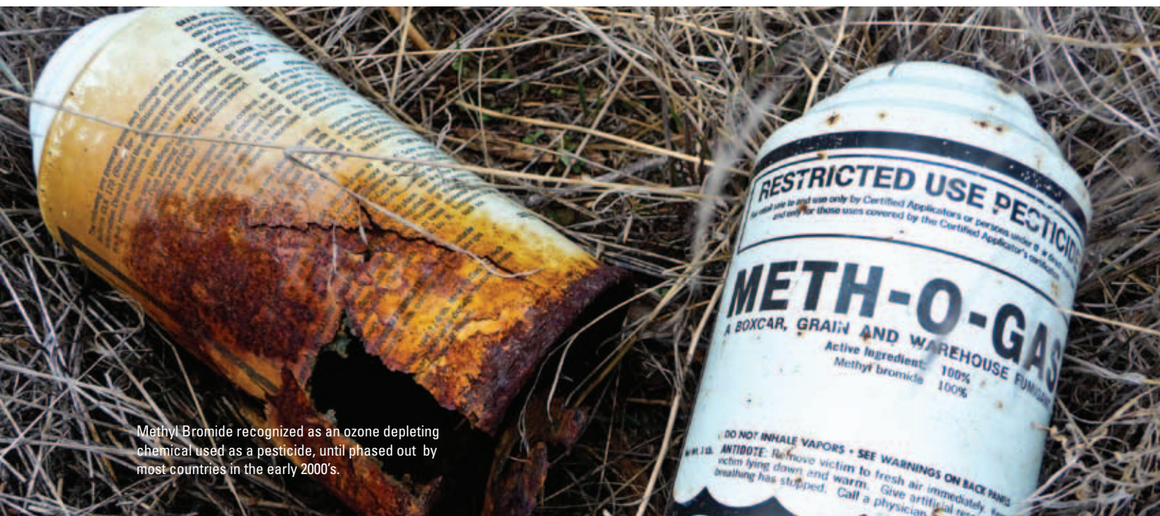
Methyl Bromide recognized as an ozone depleting chemical used as a pesticide, until phased out by most countries in the early 2000's.

The goal of the GEF's chemicals program is "to promote the sound management of chemicals throughout their life-cycle in ways that lead to the minimization of significant adverse effects on human health and the global environment." This goal is aligned with other internationally agreed goals and objectives, including those of the SAICM, the global chemicals strategy that provides a voluntary policy framework for achieving such a goal. Some funding for the objectives and activities of the SAICM that contribute to global environmental benefits, beyond POPs, would therefore ensure that the GEF can fully maximise the delivery of global environmental benefits from sound chemicals management activities.