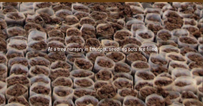
At a tree nursery in Ethiopia, seedling pots are filled.