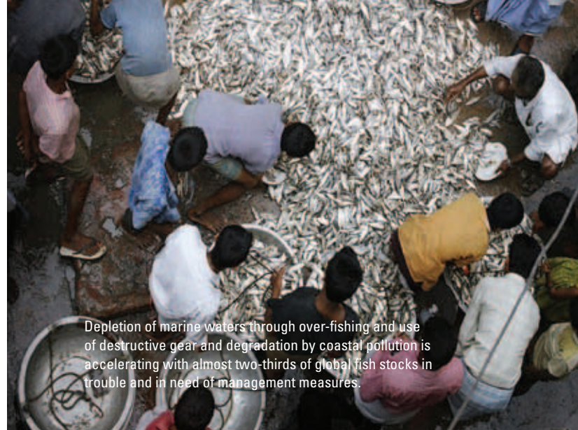
Depletion of marine waters through over-fishing and use of destructive gear and degradation by coastal pollution is accelerating with almost two-thirds of global fish stocks in trouble and in need of management measures.

GEF pilot successes in support for the GPA and nitrogen pollution reduction will be continued to reduce land-based nutrient pollution of shared LMEs and their coasts. This is aimed at catalyzing global attention to disruption of the nitrogen cycle and to limit expansion of “Dead Zones” that interfere with food security and livelihoods. National and local policy, legal, institutional reforms to reduce land-based inputs of nitrogen and other pollutants will be pursued. Incorporation of nutrient reduction into ICM policies and plans would have been systematic in the higher scenarios as would have been innovative partnerships to complement the IW platforms in the Earth Fund such as “Rebuilding Ocean Fish Stocks” to achieve broader scale and global impact of the platforms with the business community. These will now be limited.