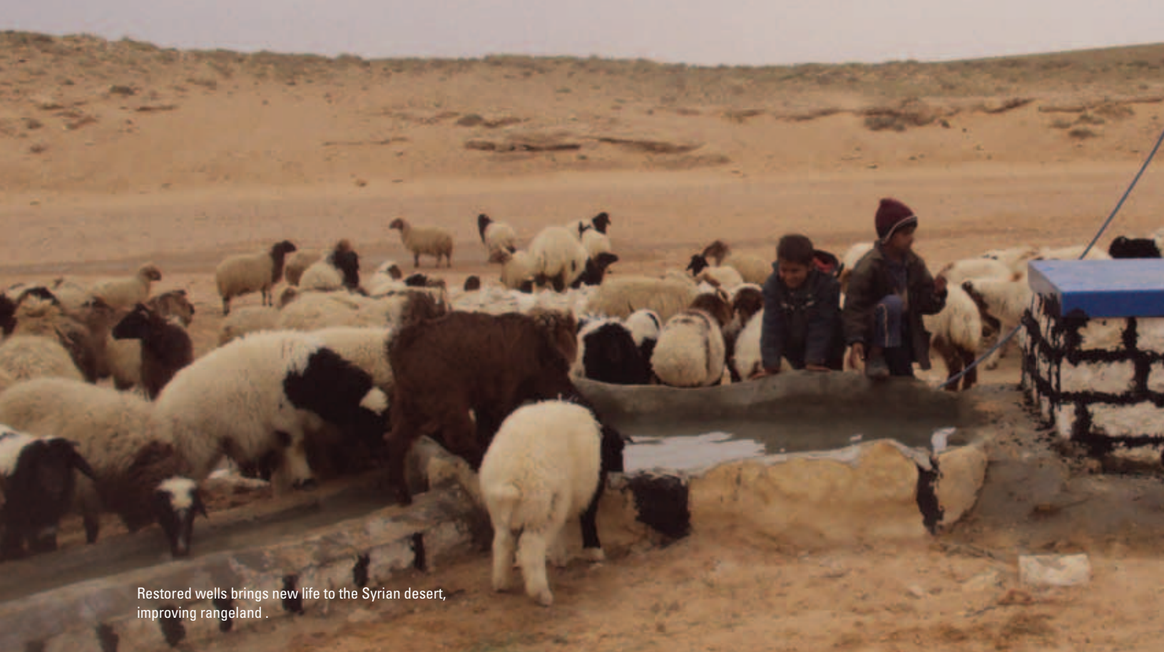
Restored wells brings new life to the Syrian desert, improving rangeland .