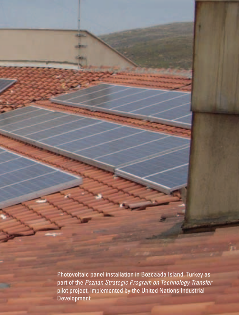
Photovoltaic panel installation in Bozcaada Island, Turkey as part of the Poznan Strategic Program on Technology Transfer pilot project, implemented by the United Nations Industrial Development

Options to be explored by the GEF to support the carbon markets may include: (i) capacity building to help create enabling legal and regulatory environment; (ii) support of programmatic carbon finance and other activities under the post-2012 climate regime; (iii) demonstration of technical and financial viabilities of technologies; (iv) partial risk guarantees and contingent financing for carbon finance projects; and (v) co-financing of innovative projects, with credits to be retained in the recipient country for further project replication. GEF engagement in carbon finance activities will complement other programs and reforms in GEF-5.