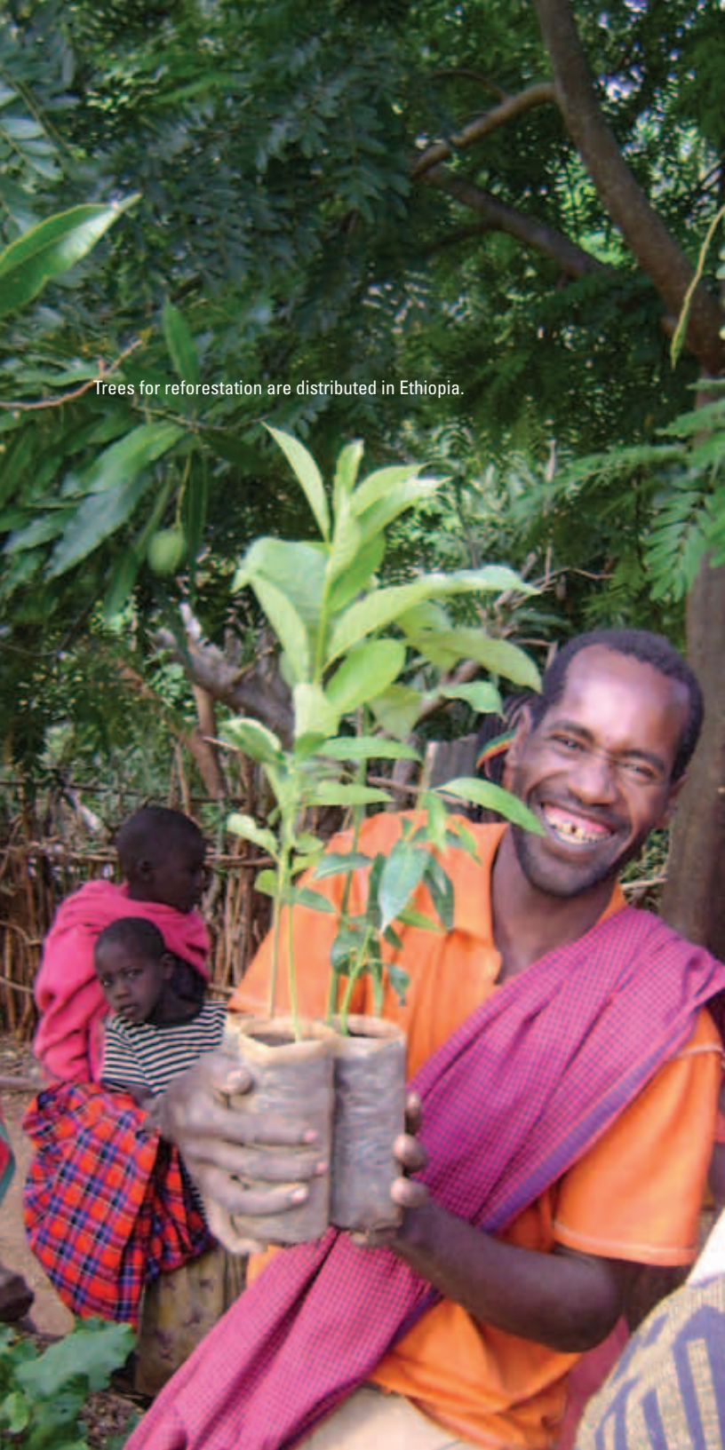
Trees for reforestation are distributed in Ethiopia.