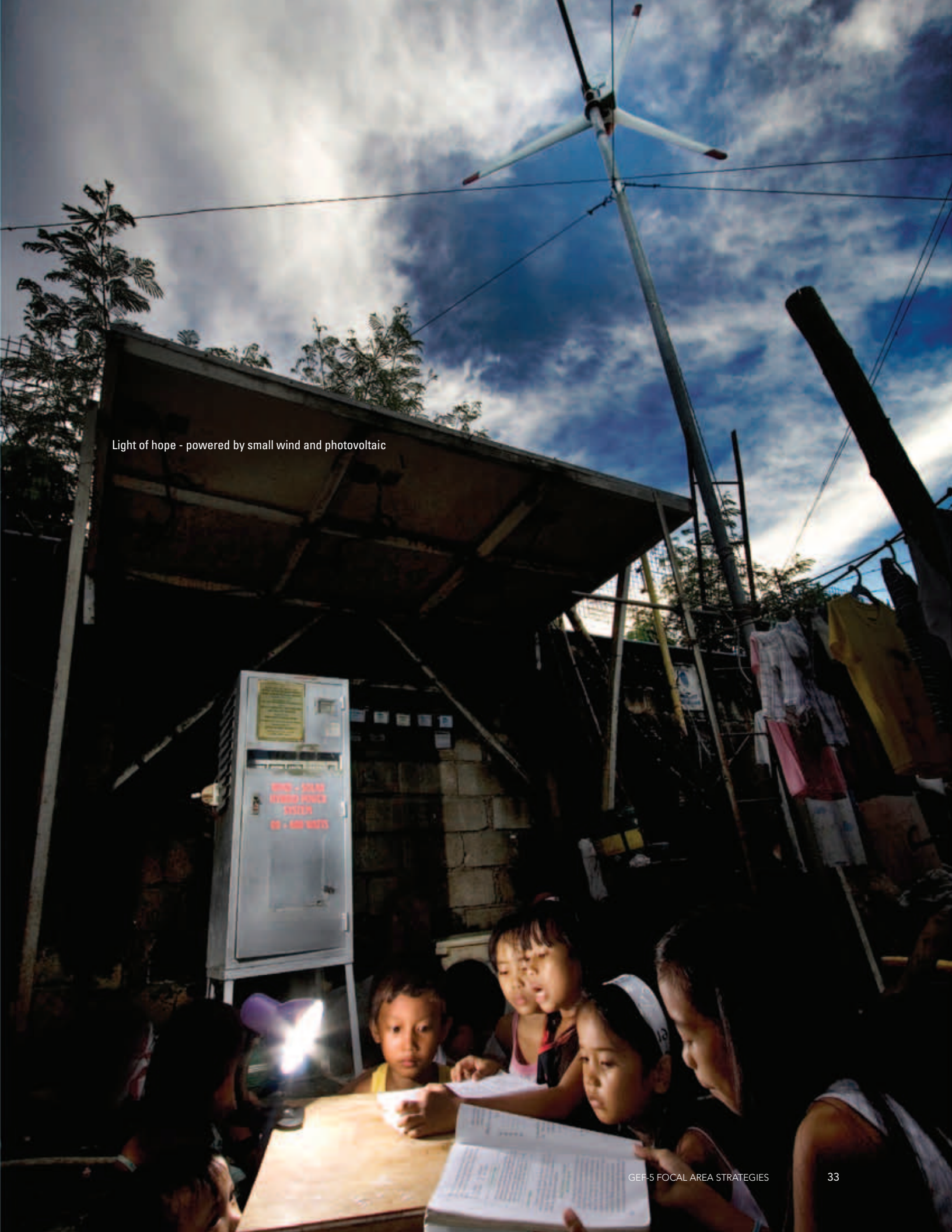
Light of hope - powered by small wind and photovoltaic