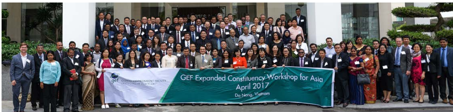
GEF ECW Vietnam Group Photo

The GEF Expanded Constituency Workshop (ECW) for the South Asia, East Asia and China constituencies took place in Da Nang, Vietnam from 4 to 7 April 2017. Over 140 participants, including GEF and Convention focal points, representatives from Civil Society Organizations, GEF Staff and GEF Agency colleagues from ADB, FAO, FECO, UNDP, IUCN, WB and WWF as well as representatives from the Stockholm Convention, the UNFCCC Secretariat and the GCF participated in the workshop. ( Agenda | Participants )