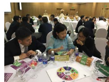
Participants from Mongolia discuss the merits of stakeholder collaboration and sub-basin management during the WWF eco systems game.

The second day of the ECW began with a training course on “ The Art of Knowledge Exchange ”. Using GEF projects as examples, this hands-on activity shows best practices, key ideas and methods behind successful knowledge exchange. After the Knowledge Exchange course, there were presentations and discussions on Stakeholder Engagement and Gender Mainstreaming, Cross-Cutting Capacity Development (CCCD) and Green Finance .