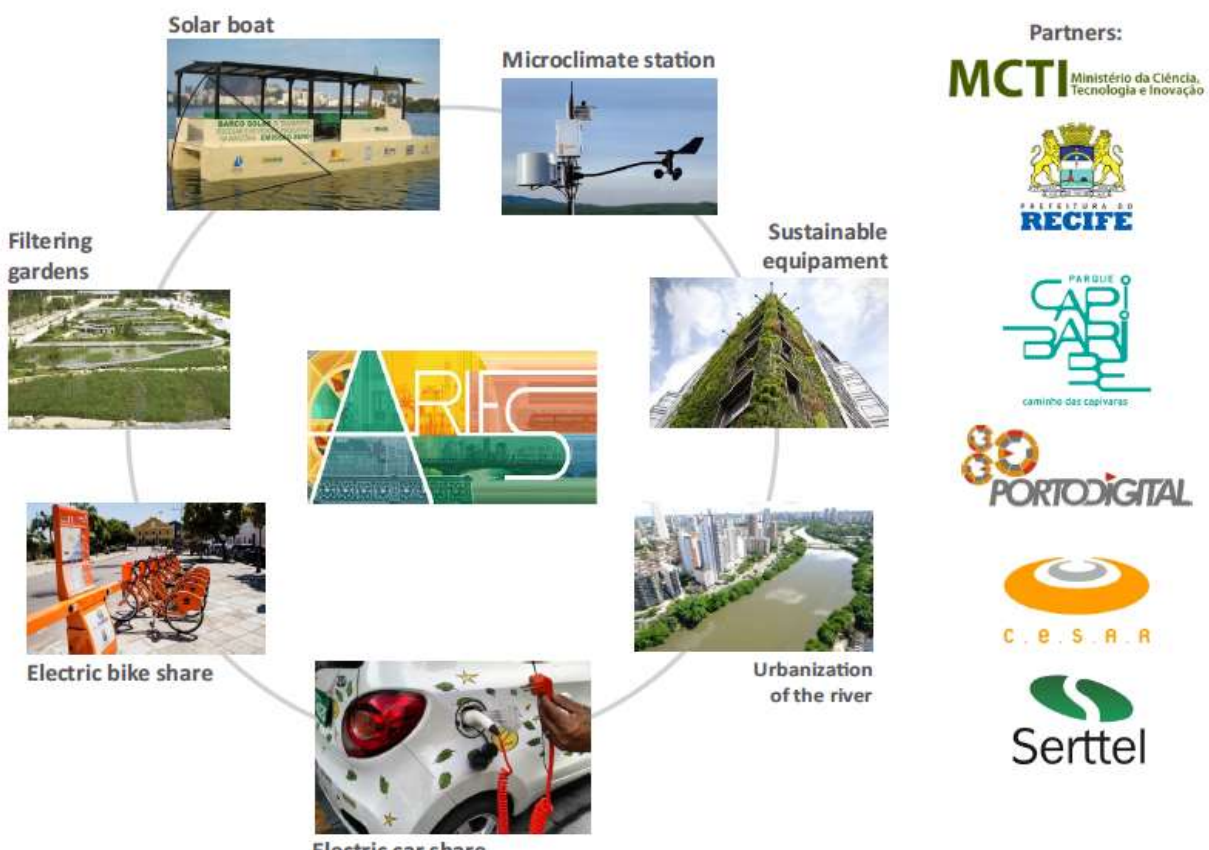
Fig. 4. Framework for integrated urban sustainability in the city of Recife, Brazil

Innovativeness, sustainability and scaling-up potential: The project will improve the baseline conditions for targeted communities to the severity of anticipated climate change effects by decreasing energy and water insecurity. Direct benefits for local communities from ecosystem-based adaptation in the Paranoá and Descoberto basins will include improved natural capital and ecosystem services that underpin livelihoods such as agriculture and water production. Additionally, the GEF-financed project is expected to support evidence-based climate change policies and institutional arrangement, help the implementation of best practices to improve water quality and quantity, avoid land degradation and create ecological corridors, increasing availability of natural habitat for plant and animal species that depend on these ecosystems.