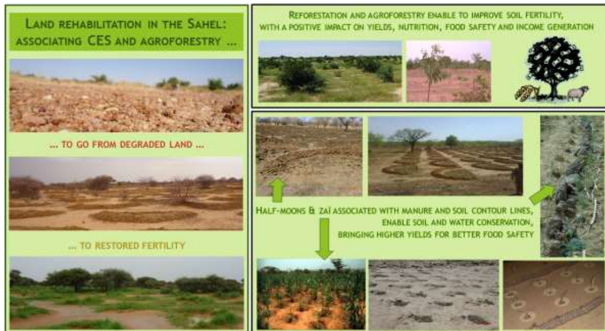
Fig 2. Overview of the soil and water conservation, soil protection and restoration, and agroforestry practices in the Sahel

Stakeholder engagement: The lead agency for the project at national level is the Ministry of Agriculture and Livestock, which will work closely with the High Commission for the Initiative on Nigeriens feeding Nigeriens (HCi3N). Major stakeholders include Regional Directorate of the Environment, Water User Associations, local authorities (communes), Public Building and Works, regional and departmental services for waterworks, specialized service providers and the Regional Agriculture Chambers. To identify or introduce innovative practices, the program will also engage local research institutions and centers of excellence, including the National Institute for Agricultural Research of Niger, the International Center for Research in the Semi-Arid Tropics (for agricultural practices and innovative plant material) and the AGRHYMET Regional Centre (for observation and management of climate risks). The project will engage over 22,400 households or close to 157,000 people (including 30% women and 30% youth) as direct beneficiaries.