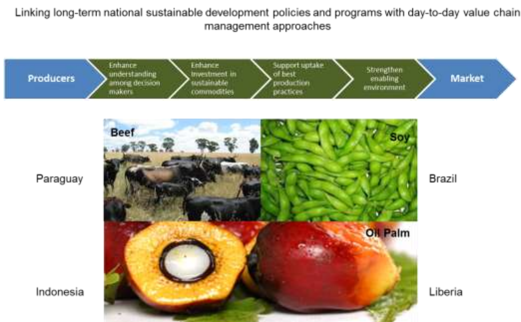
Fig. 5. Supply Chain Approach for the Commodities IAP program

55. The adoption of better practices and sustainability principles can contribute to forest maintenance through protection of water sources, identification and set aside of high conservation value and high carbon stock areas, and other important activities that contribute to sustaining environmental services. By advancing an integrated 'supply chain' approach for beef, oil palm and soy, the Commodities IAP program builds momentum for sustainability and